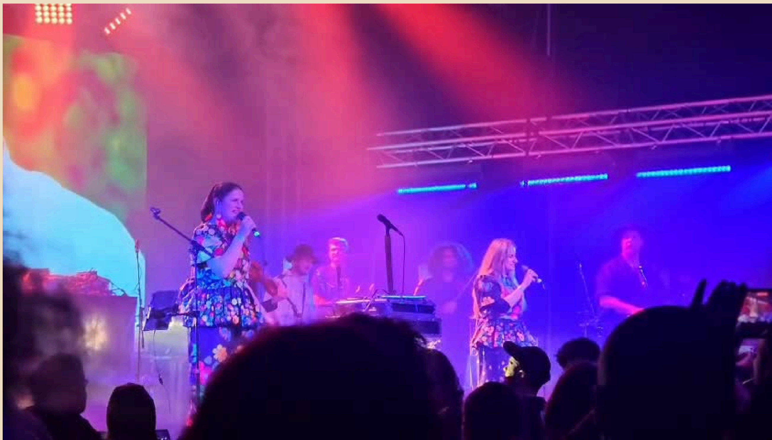
This is Dagadana, a Polish-Ukrainian band that Subcarpati invited as special guest on their concert on the 1st of December, promoting international inclusion and tradition bonding